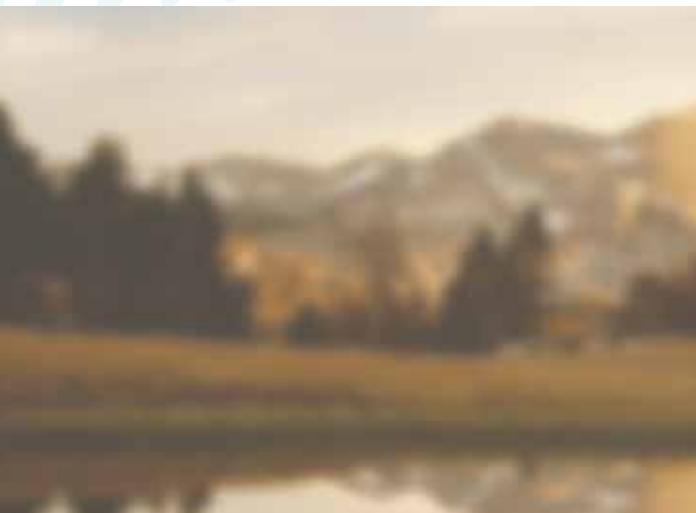
Simulated image with cataracts