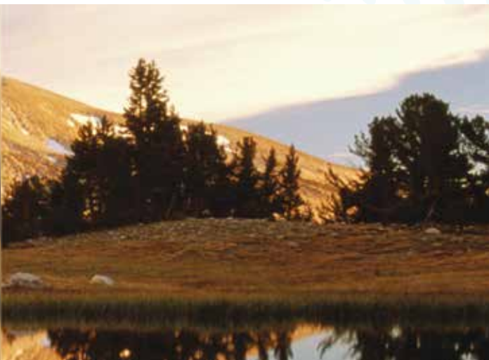
Image without cataracts